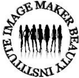
Image Maker Beauty Institute